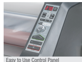
Easy to Use Control Panel