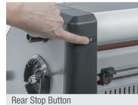
Rear Stop Button